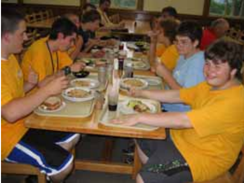
Happy I guess, we can even have seconds!