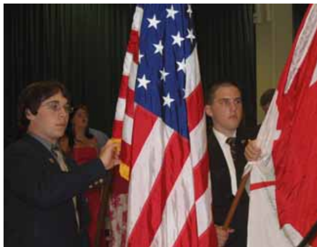
Our banners were glorious!