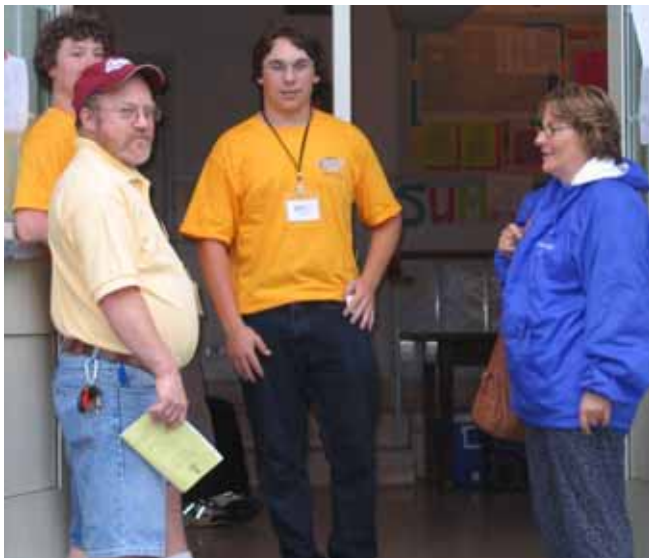
Maine DeMolay & Advisors "We're here, now What?"

It's all about food, fun and fellowship!