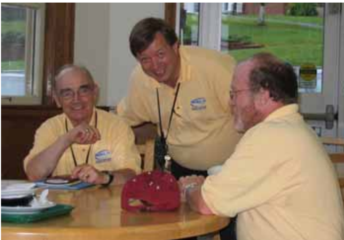
Happy I guess, look at the people I'm with!